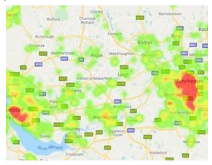
Stolen bike page - a heatmap of the stolen bikes in your area.

Over the course of the project, officers held hundreds of BikeRegister cycle marking initiatives to help protect cyclist's bikes from theft.